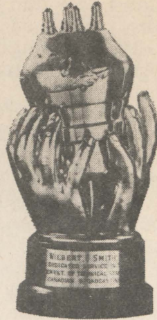
"The Canadian Engineering Award"